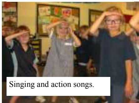
Singing and action songs.

In our Indonesian lessons this term we are learning lots of strategies to help us learn and remember new questions and answers, as well as words that help us make our responses more interesting and detailed.