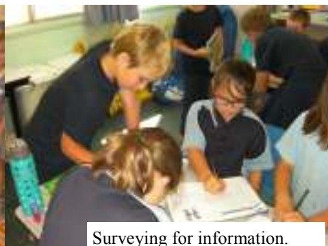
Surveying for information.