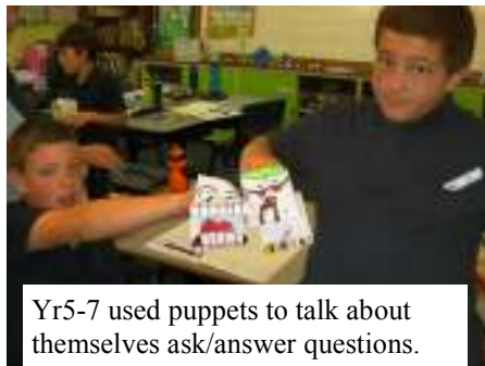
Yr5-7 used puppets to talk about themselves ask/answer questions.