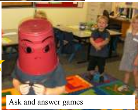
Ask and answer games

5-7 Socialising—asking and answering questions about yourself and others.